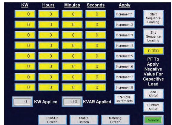
Load Application Screen