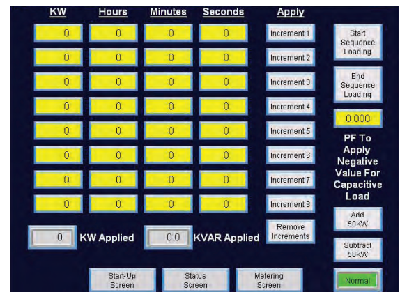
Load Application Screen