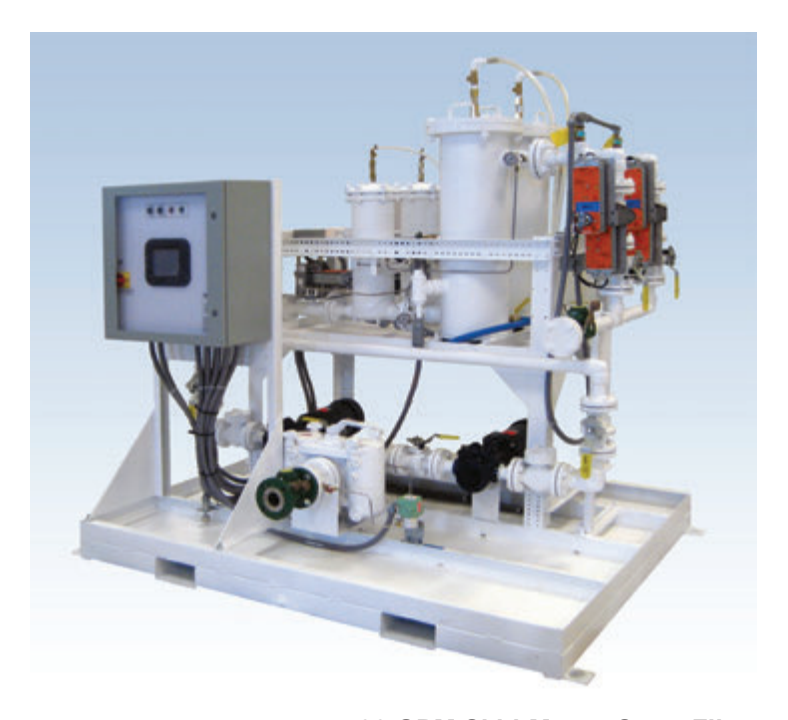
30 GPM Skid-Mount SmartFilter