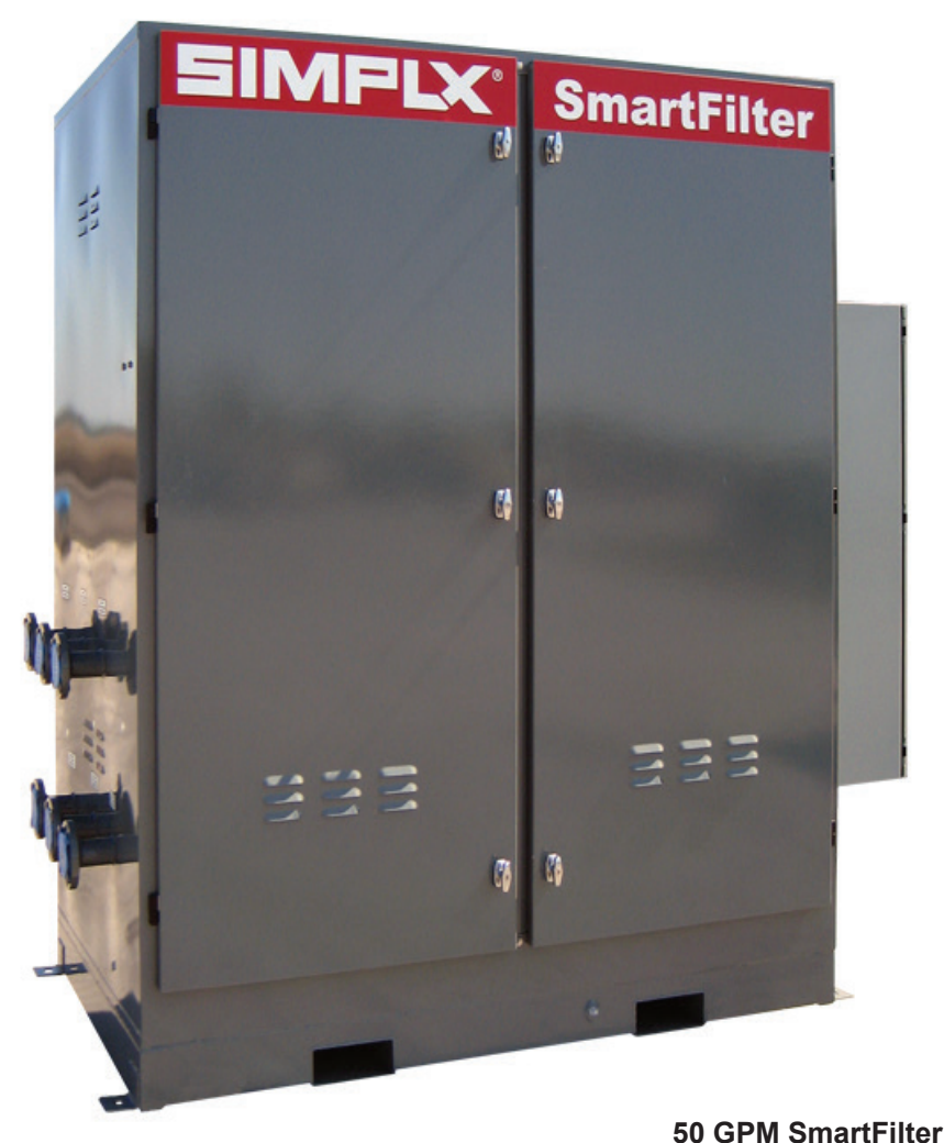
30 Of M Sinarti liter