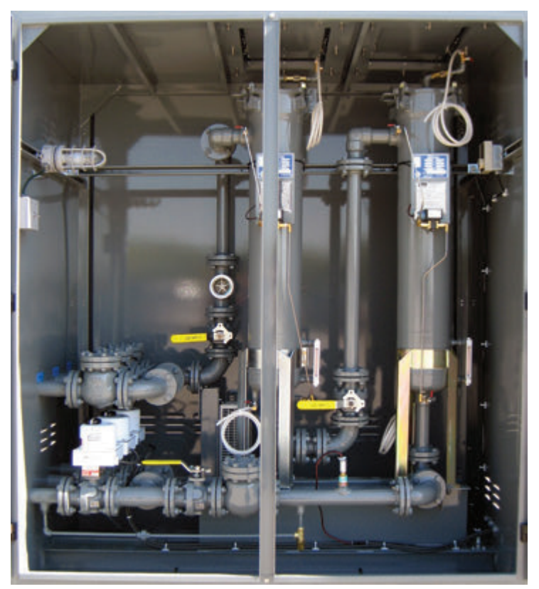
50 GPM SmartFilter

The Simplex SmartFilter is today's answer to pressing fuel quality concerns: a standard, factory-packaged filtration system of robust, user-friendly design utilizing the best filtration and water removal technology, design-built to your exacting project requirements.