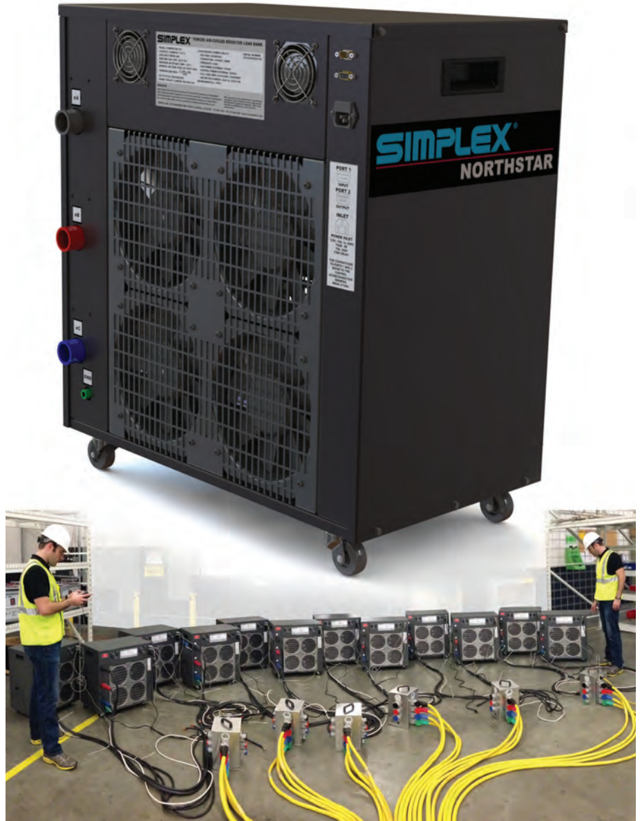
1800KW, 600V NorthStar Load Bank system formed by networking 12 NorthStar Units to a single Master Controller.