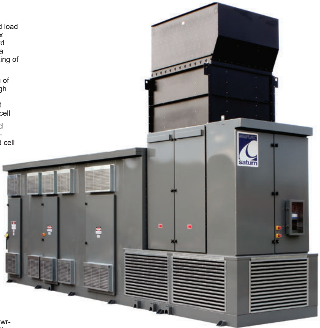
Saturn-HV with optional Sound Attenuated Base