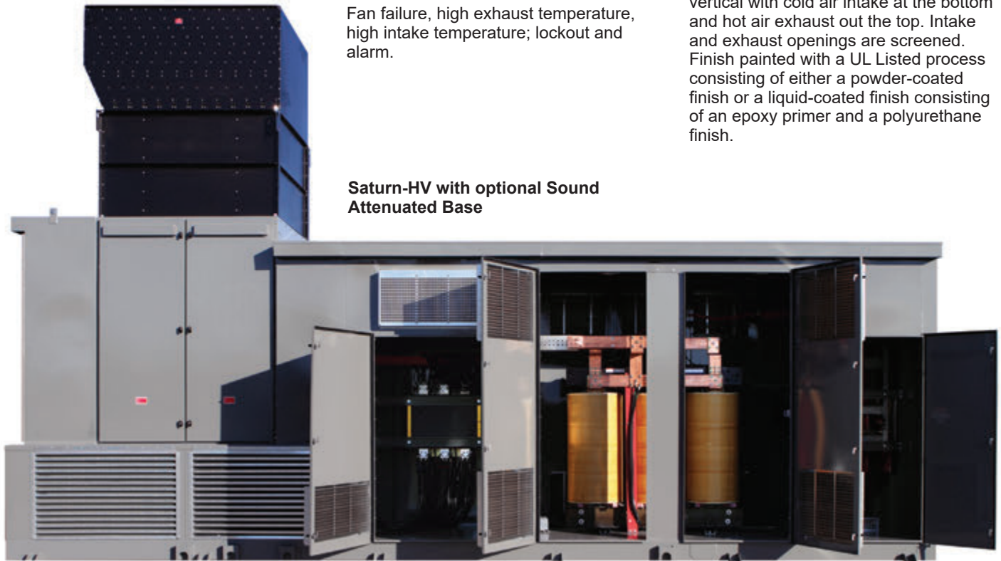
Saturn-HV with optional Sound Attenuated Base

The load bank enclosure is of double wall construction for cool exterior and thermal isolation of the load elements. Cooling airflow through the enclosure is vertical with cold air intake at the bottom and hot air exhaust out the top. Intake and exhaust openings are screened. Finish painted with a UL Listed process consisting of either a powder-coated finish or a liquid-coated finish consisting of an epoxy primer and a polyurethane finish.