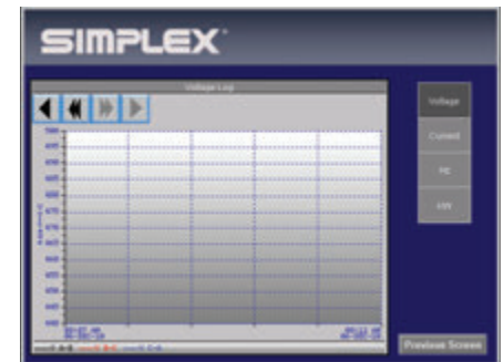
Metering Trends Screen