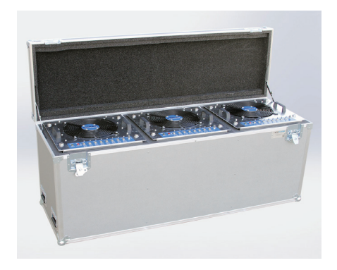
Rentals supplied packaged in one, two, and three unit cases.